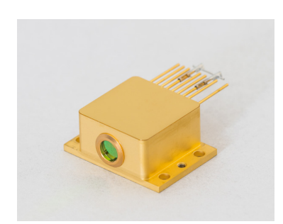
Fig. 2 QC-XT lasers are typically delivered in HHL housings.